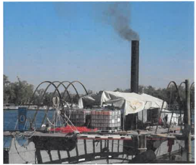
Hopefully more of this to come.