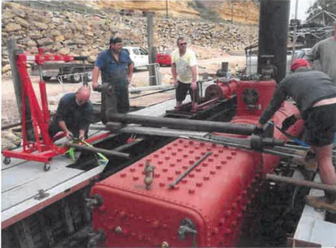
Placing of main engine crank.