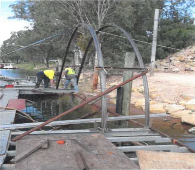
Paddle box frame installation in progress.