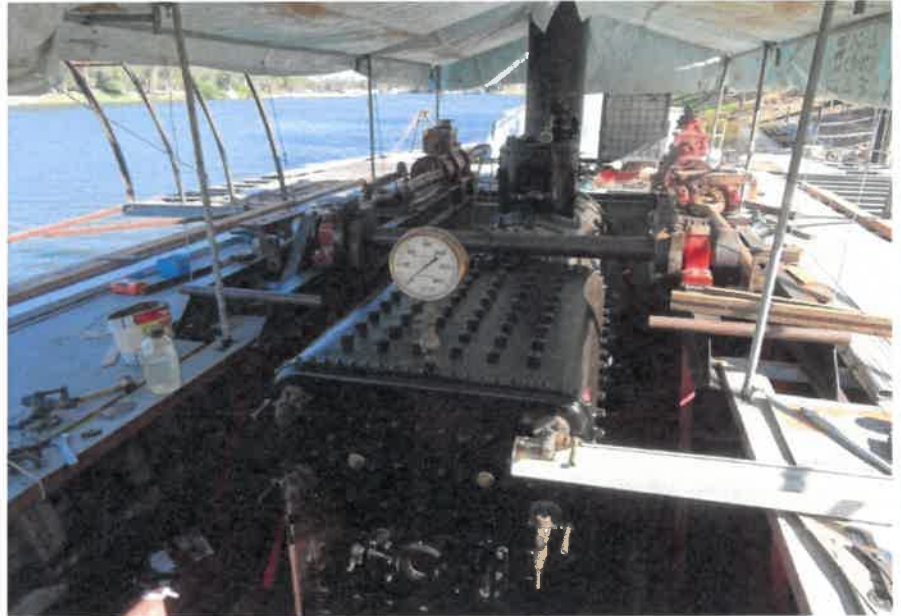
Boiler painted and ready for hydro tests