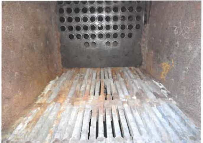
Fire bars in place in the fire box.