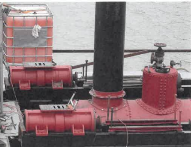
Engine cylinders, beds and funnel in