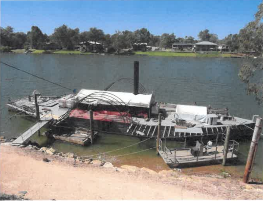
Engine room cover in place.