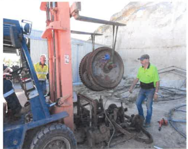
Dismantling steam winch for sand blasting