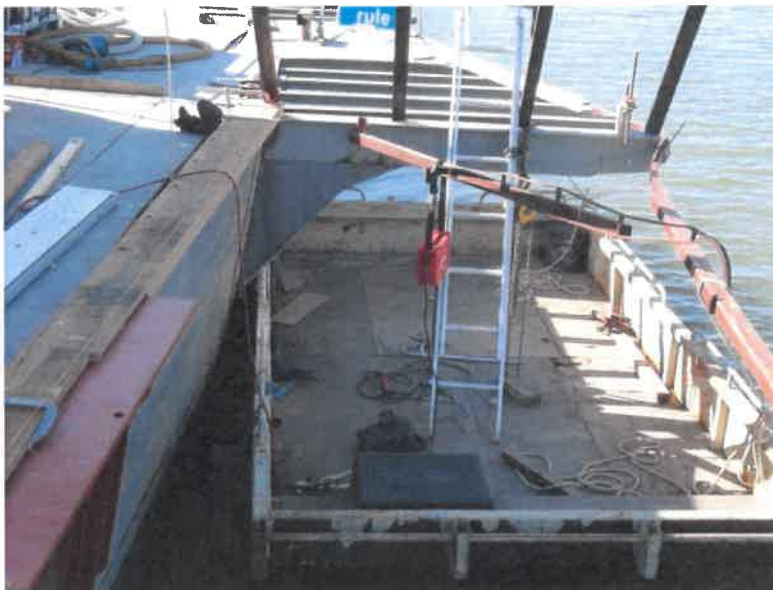
Work on the paddle boxes.