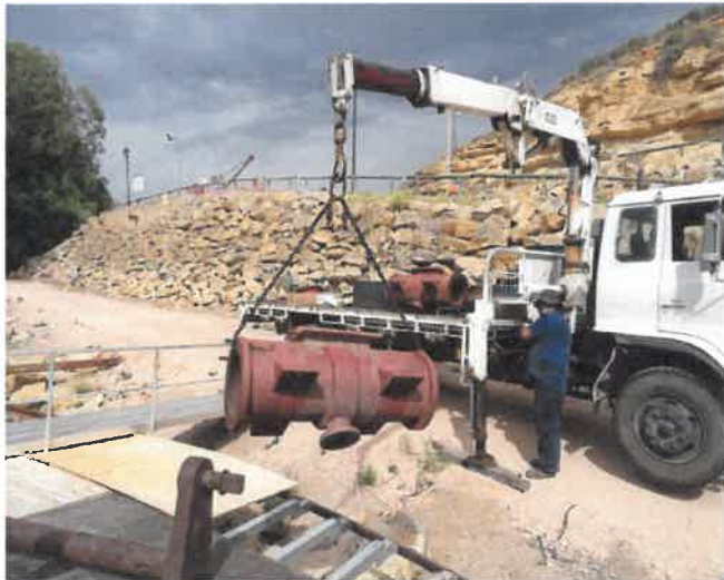
Unloading one of the piston cylinders.