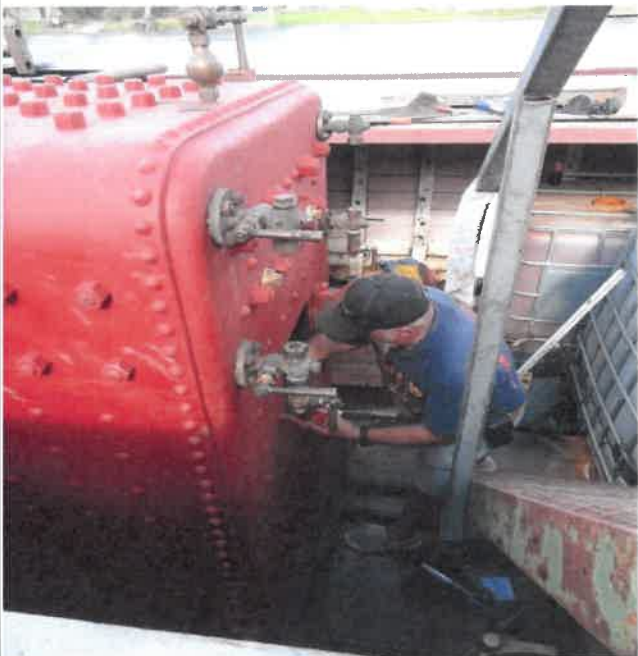
Setting the first fire