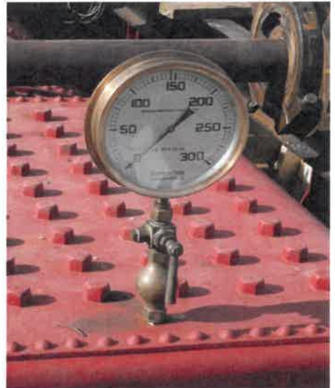
Right: Pressure gauge in place for hydro tests.