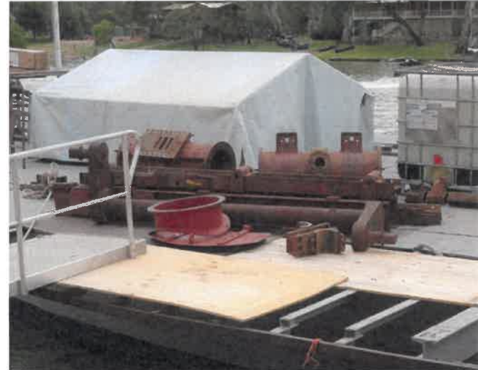
Steam cylinders, engine beds and crank