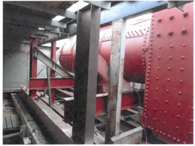
Boiler supports in place.