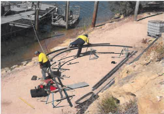
Preparing paddle box frames for installation.