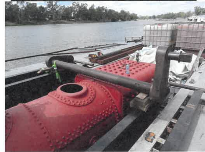
Engine crank in place.