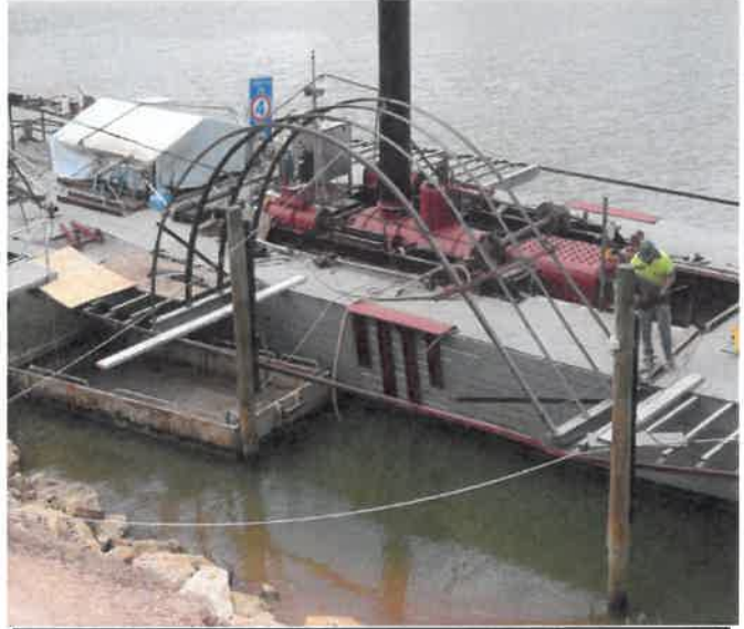
Port side paddle box frames in place, the boat will need to be turned around to do the starboard side.