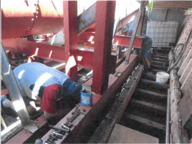
Volunteers cleaning and vacuuming the